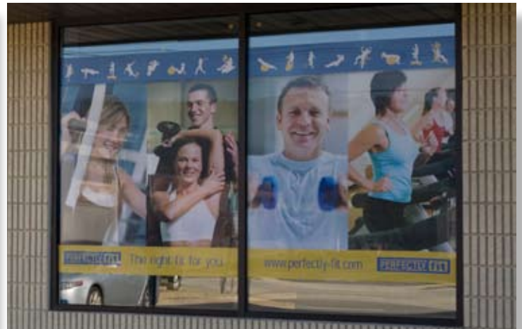
During daylight hours, the window graphics create almost a one-way mirror effect: clients in the studio can see out, but those on the street side can't see in.

As for the windows, the team agreed that covering them with an opaque graphic would ruin the brightness offered by the sun's natural light; but still, clients needed relief from the direct glare. A further challenge was to maintain the open feeling the windows offered, while protecting client privacy as they worked out. For Catalyst and Mike Hicks, drawing attention from passersby to the Perfectly Fit facility was an important goal as well. The main road through East Greenwich passes directly in front of Perfectly Fit, offering an opportunity to promote the business in a more engaging way than standard signage.