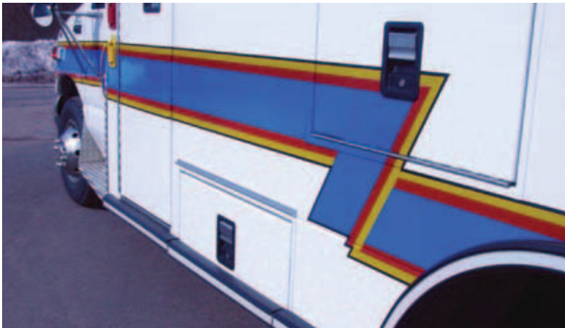
Microprismatic films ensure high visibility for safety vehicles, such as zig-zag pattern on this ambulance at the University of Connecticut.