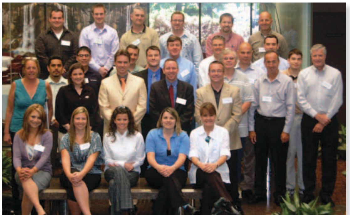
Some of the more than 40 attendees from FLEXcon's Pressure-Sensitive Films, Functions & Opportunities Seminar.

Attendees also learned how various aspects of the pressure-sensitive film construction can impact performance and ultimately determine the success or failure of an application. Along with touring FLEXcon's labs and production facilities, attendees also had the opportunity to network, gain insights on market trends and application opportunities and learned how to optimally use existing equipment and personnel to grow their businesses with pressure-sensitive films and adhesives.