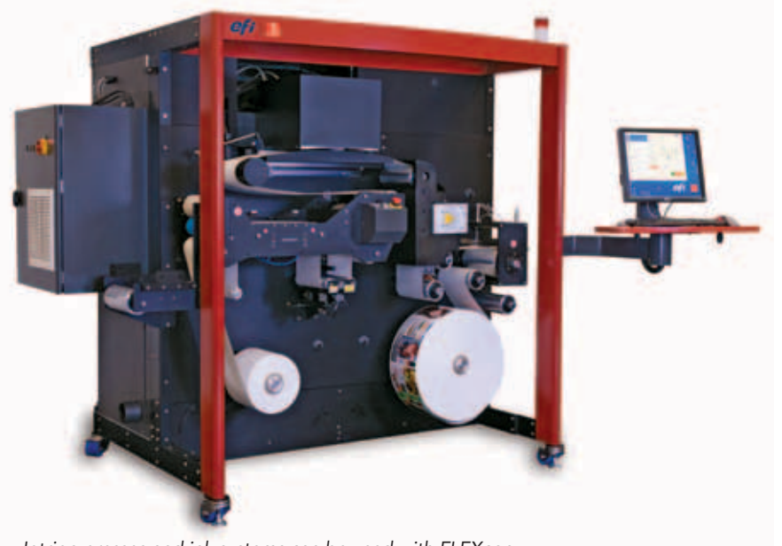
Jetrion presses and ink systems can be used with FLEXcon substrates to cut both production costs and waste.

In order to achieve compliance while maintaining speed-to-market, design engineers, converters and print service providers will come to rely on knowledgeable label material suppliers and printer manufacturers who understand these evolving requirements and provide the proper materials and printing systems for each product. Just as FLEXcon and EFI have benefited from its alliance, converters and print service providers can capitalize on the benefits of this partnership to successfully navigate the regulatory compliance landscape, for in a global economy, ensuring that OEMs are using symbols to communicate safety information is as practical as it is essential.