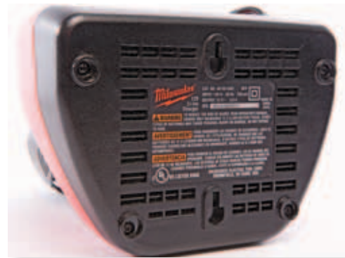
FLEXcon substrates, like COMPUcal® EXCEL™ and THERMLfilm SELECT®, when printed on Jetrion presses provide a streamlined approach to the UL recognition process.

FLEXcon offers a variety of off-the-shelf and custom products that embrace digital technologies. While you may recall the article in the Spring 2010 issue that focused on HP Indigo-printable substrates, this article will concentrate on how FLEXcon and EFI, maker of Jetrion® presses, have teamed up to produce a press-ink-label substrate combination that will: