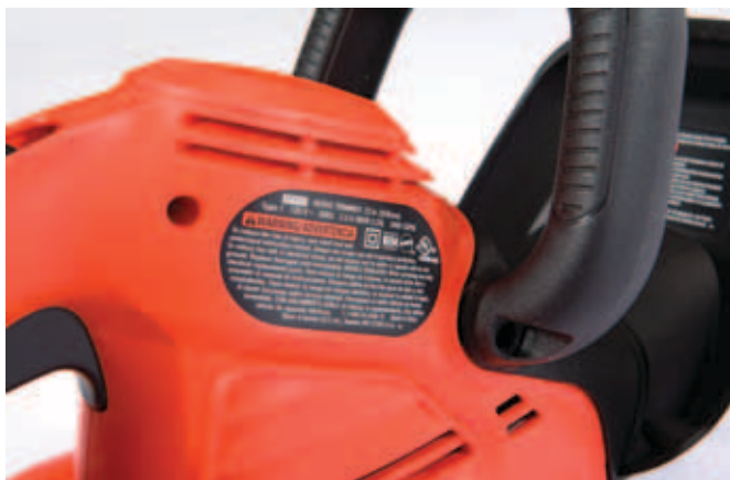
Pressure-sensitive film labels can endure exposure to harsh chemicals, such as oil and gasoline.

Whether it is a power tool, an electronic device, or an automobile, labeling for these types of applications must identify the product and the manufacturer as well as display crisp images that reinforce product branding and product quality. Pressure-sensitive labels are ideal to support high-quality printing and superior legibility.