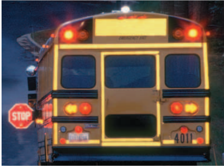
Reflexite's V82 product is ideal for school bus applications, where state and federal guidelines require the highest degree of reflectivity for safety purposes.