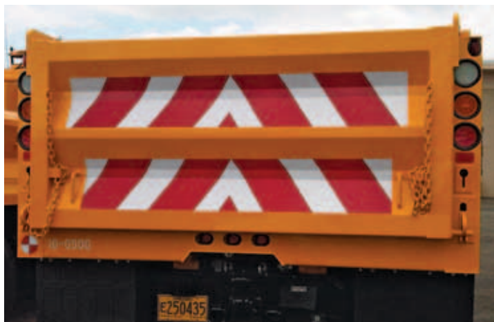
When it comes to fleet markings, safety is of primary importance. Heavy equipment, such as this truck, must have the highest level of visibility.

In the case of microprismatic technology, the light is reflected off of three facets, and offers total