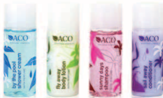
Increase business in the realm of consumer products, including health and beauty, with that no-label look using optiFLEX films from FLEXcon.

Relatively new to today’s digital label printing industry, EFI’s Jetrion 4000 Series UV inkjet presses have become increasingly popular in the durable labels market due to their durable UV inks, high-quality print capability, smaller footprint and lower price tag – compared to alternative label printing technologies. Likewise, FLEXcon’s COMPUcal EXCEL and