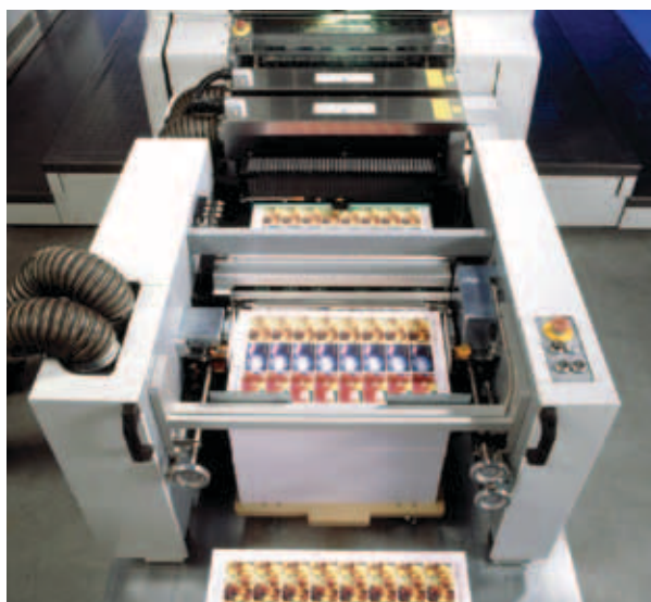
Printers looking to expand their market share can use film to achieve unique results.