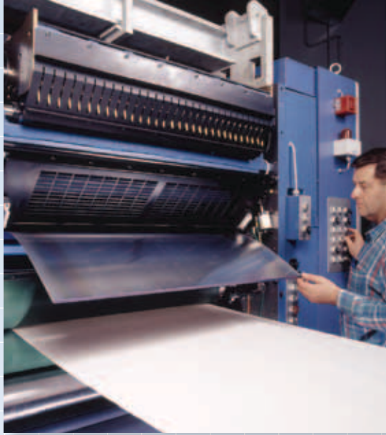
Pressure-sensitive films are a natural match for offset printers.

Similarly, printers can turn to experienced suppliers in an effort to help convince their customers that film offers more opportunities than paper. Bringing the supplier into a joint-meeting between you and your client is a very effective way to develop confidence and comfort in a new approach. Just as suppliers can provide on-site instruction and support to press operators, so too can those