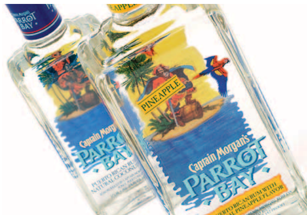
The FLEXcon-EFI-Jetrion alliance has also yielded prime labeling solutions that are ideal for a host of consumer products, including food and beverages.

The FLEXcon-EFI-Jetrion alliance has also yielded prime labeling solutions that are ideal for food and beverage, health and beauty, household and chemical; and over-the-counter (OTC) and ethical pharmaceutical labeling and flexible and semi-squeeze packaging applications.